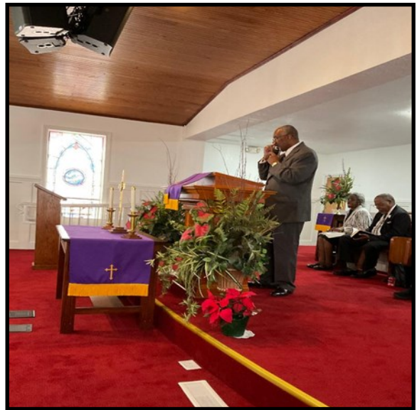
Zion Wall's 120th Homecoming was awesome!